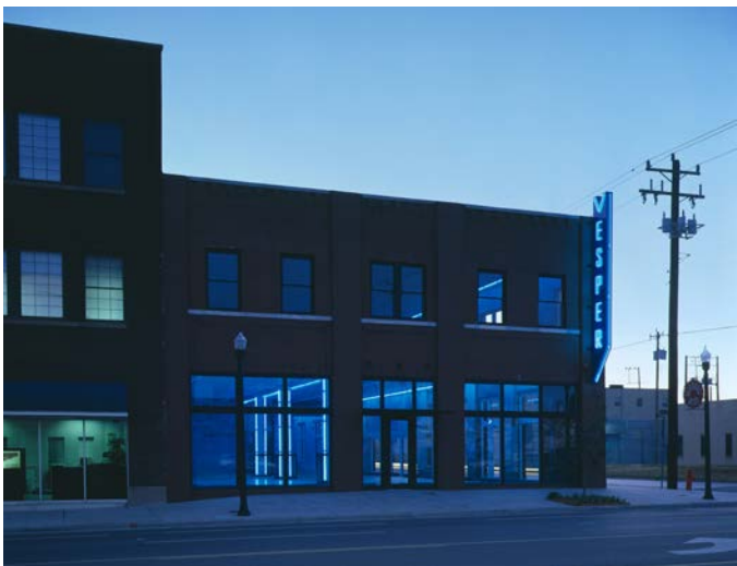
East elevation at dusk

Client: Vesper Building Completion: June 2001 Scope: Parking 7,034 SF Cost: $352,480 Awards: National AIA Honor Award; AIA Central States Region Award; AIA Oklahoma Award of Excellence; I. D. Magazine Annual Design Review Design Distinction Award; 23rd Annual Interiors Awards; Oklahoma Historical Society, Citation of Merit