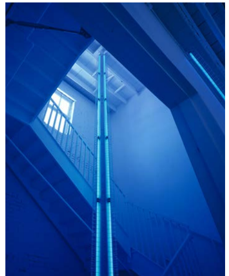
Nighttime - stair interior