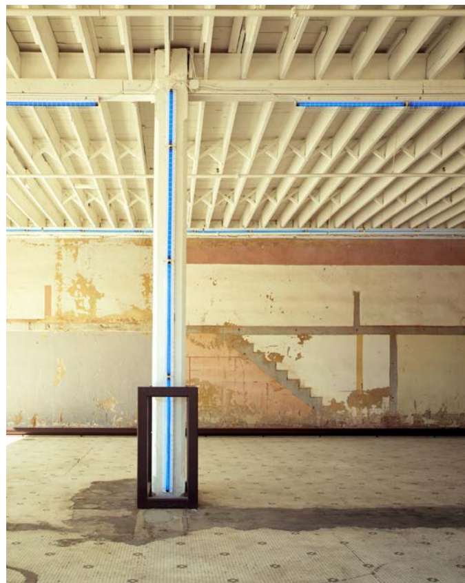
Daytime - view looking south