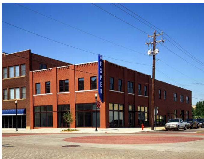
Daytime - Broadway Avenue looking southwest