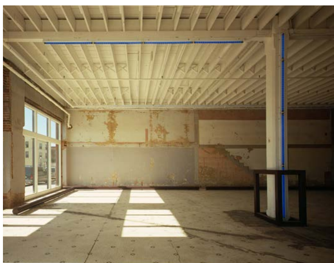
Daytime - view looking south along the east storefront