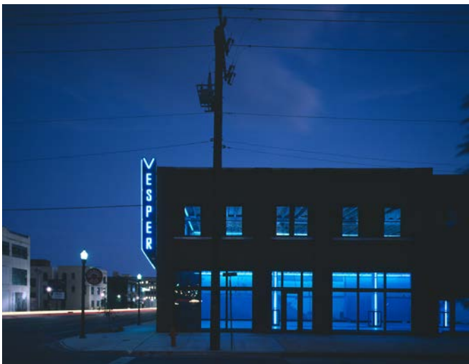
North elevation at dusk