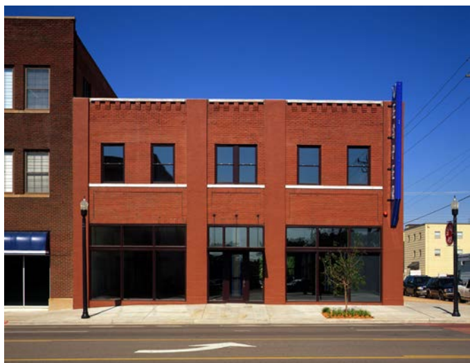
Daytime - east elevation