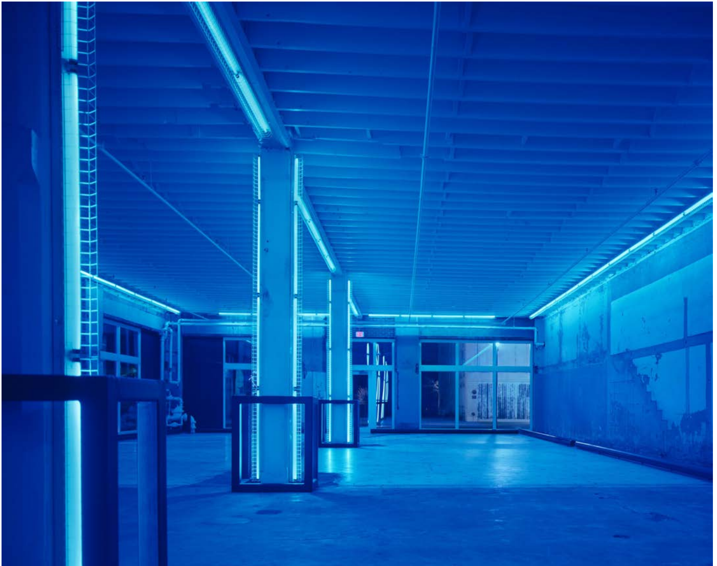
Nighttime - interior view showing south half looking east