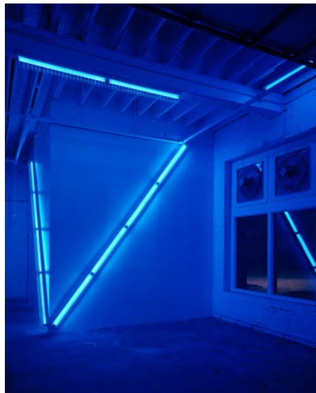
Nighttime - interior view looking southwest toward fire stair enclosure