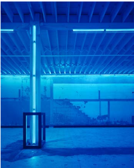
Nighttime - interior view looking south