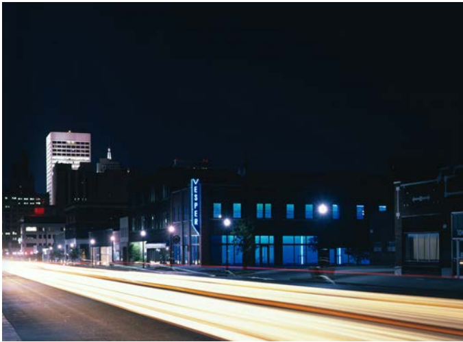
Exterior view along Broadway Avenue looking south