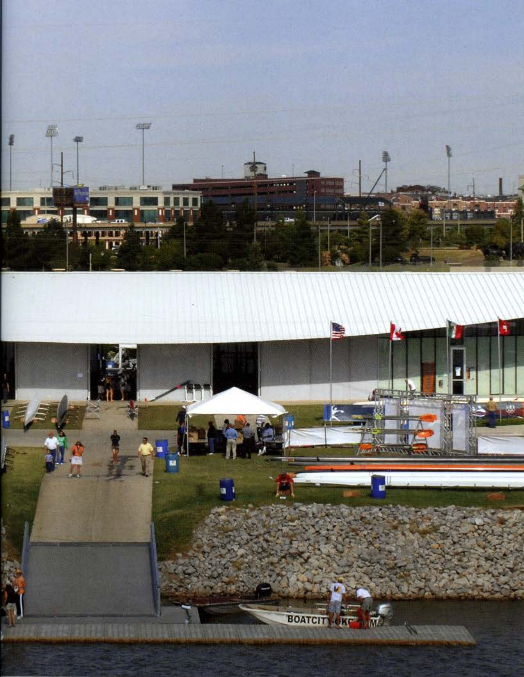
Chesapeake Boathouse, Oklahoma City

national stage, including four medals at the 2012 USRowing youth national championships in Oak Ridge.